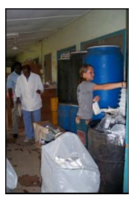
Volunteers unpacking donated supplies