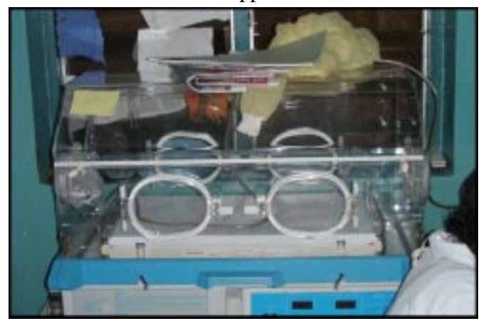
New incubator arrived via the Ghana Bandage Project and was provided by past volunteers