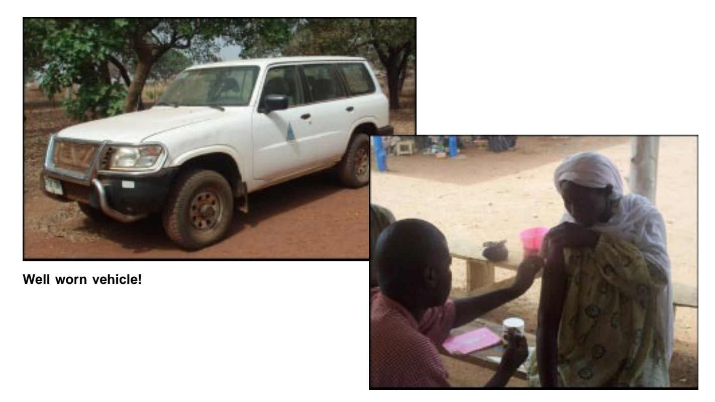
A public health worker giving an immunization.

The Public Health unit of BMC has always provided important medical and spiritual outreach to 62 villages in the region. They are in the field spreading Christ's message and love. To do their job they need a vehicle, and the 10-year-old workhorse is worn out. We are working with Toyota Gibraltar <a href="www.toyota-gib.com">www.toyota-gib.com</a> to purchase a comparable vehicle at a cost of about $40,000. We hope to complete this transaction within the next month.