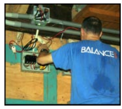
New electrical service panel being installed.

New flooring, ceilings, and lighting are also being arranged. A team from the Church at Northside in Rome, Georgia did the bulk of the rewiring of the hospital on a 10 day trip in August, which eliminated the high risk of fire from the old wiring system and greatly improved the safety of the hospital.