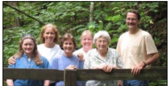
This picture was taken in the summer of 2006. It was one of the few times all of her children were together with her at one time.

Please join us in offering the Faile family our condolences.